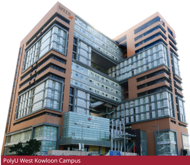
PolyU West Kowloon Campus 理大西九龍校園

五間電腦學習室、三間賽馬會藝術科技未來實驗室、兩間社工實務空間、科學實驗室、健康護理實習室、聲學和機器人實驗室、電機工程及物理實驗室、能源轉化與使用實驗室、機械力學與控制實驗室